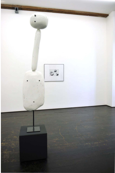
Void Flowers Exhibition View Nosbaum Reding, Luxembourg, 2015