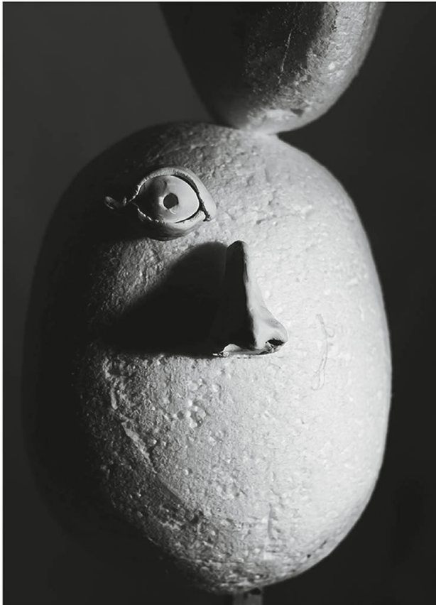
Void Flowers Exhibition View Nosbaum Reding, Luxembourg, 2015