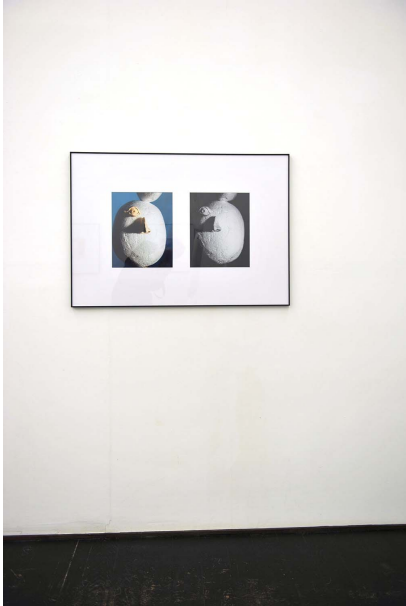
Void Flowers Exhibition View Nosbaum Reding, Luxembourg, 2015