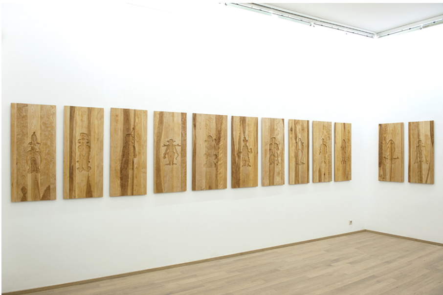
No Lemon, No Melon Exhibition View Nosbaum Reding, Luxembourg, 2018