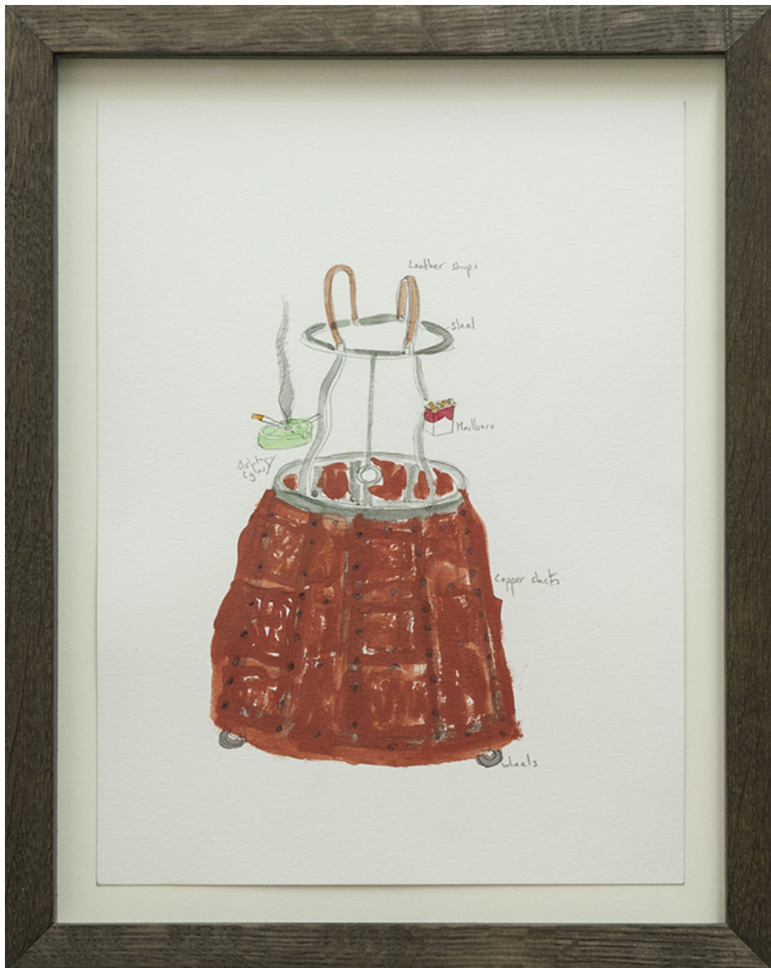
Camille , 2018 Watercolor on paper 30 x 22,5 cm Frame: 37,5 x 29,8 cm