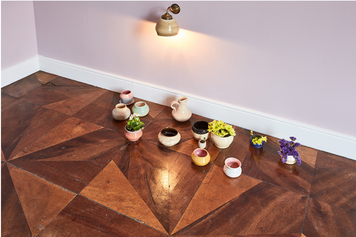
Vase esquisse , 2016 Ceramic pottery small hand-thrown vases Dimensions variable