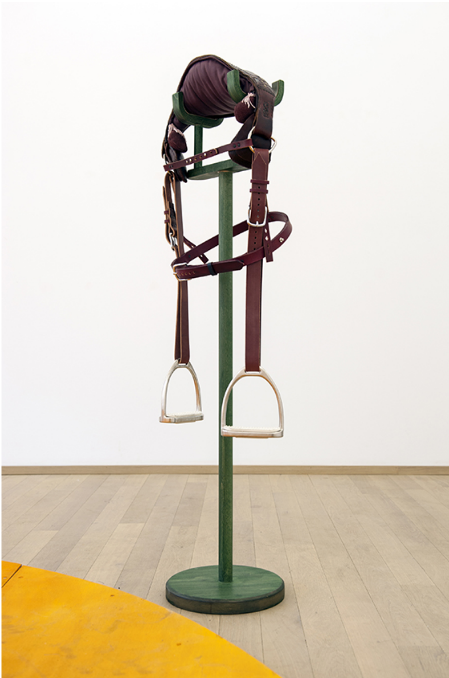
no melon , 2015 - 2018 Wearing wood, leather, embraces curtains, stirrups, metal hardware 130 x 141 x 27 cm