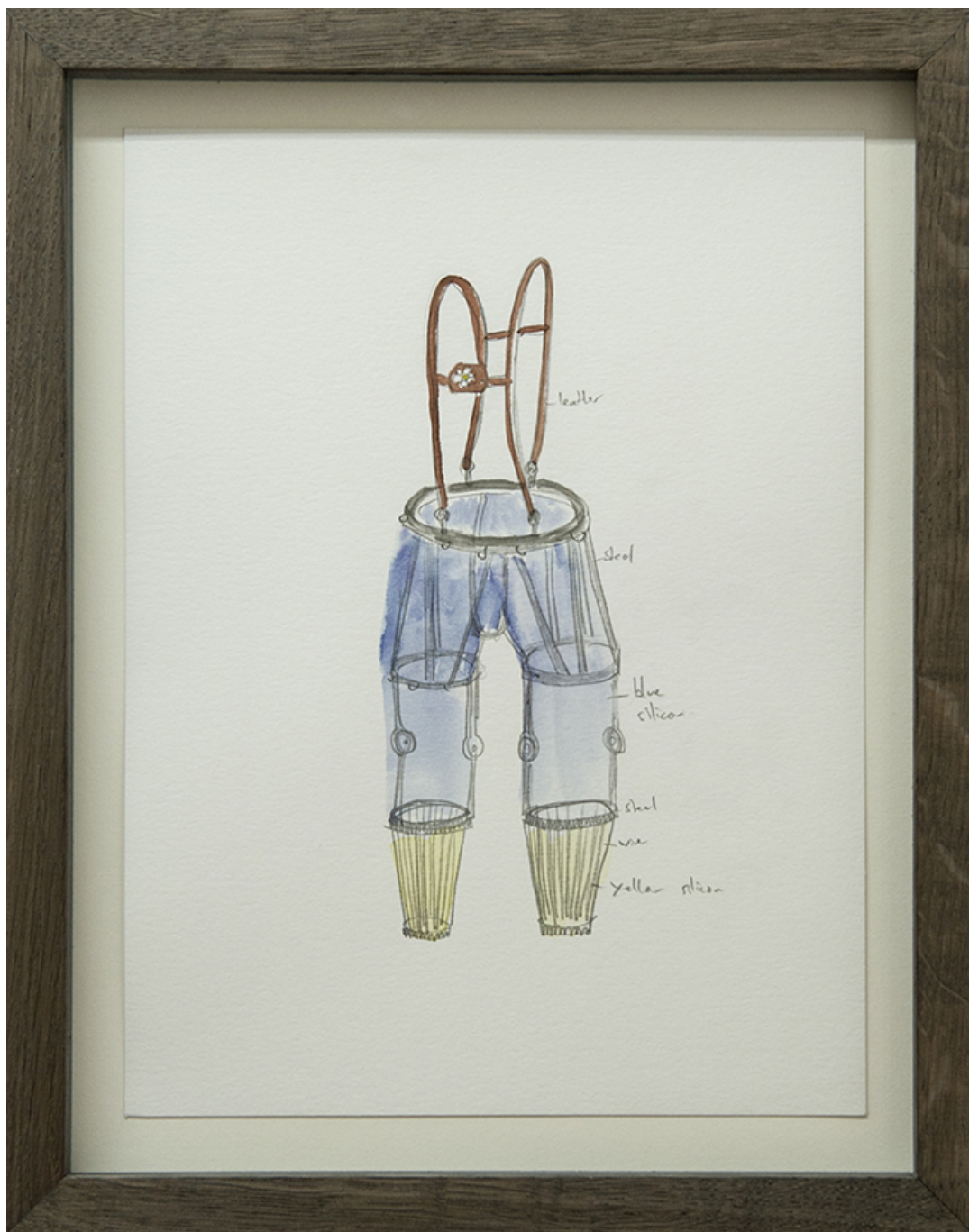
Camile , 2018 Watercolor on paper 30 x 22,5 cm Frame: 37,5 x 29,8 cm