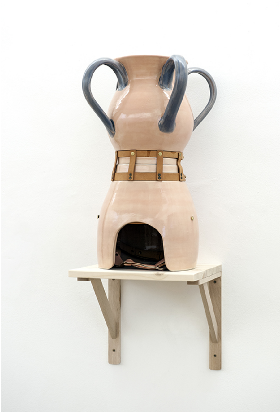
Thank you so much for the flowers - Ceramic helmet, 2016 Poterie en céramique, cuivre jaune 78 x 30 x 30 cm