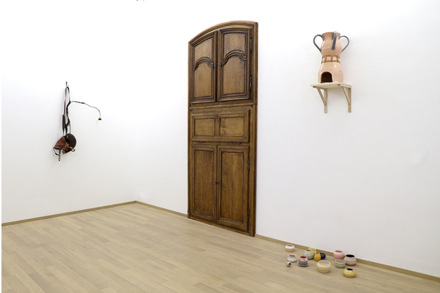
No Lemon, No Melon Exhibition View Nosbaum Reding, Luxembourg, 2018