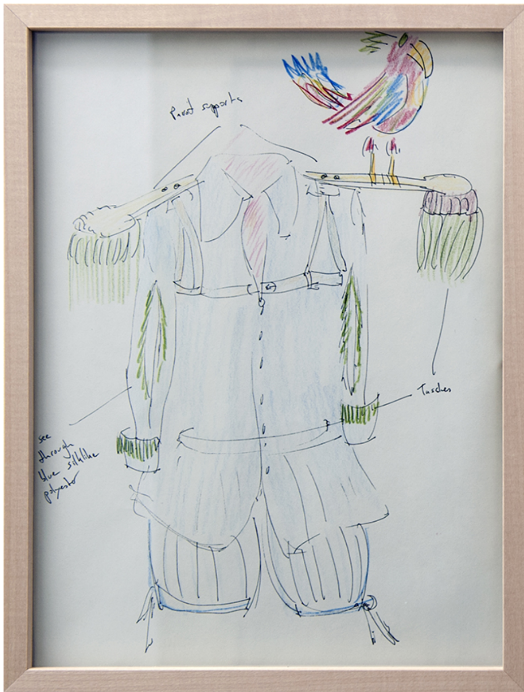
Preparation drawing for The wellbeing of things : a 5km race, 2016