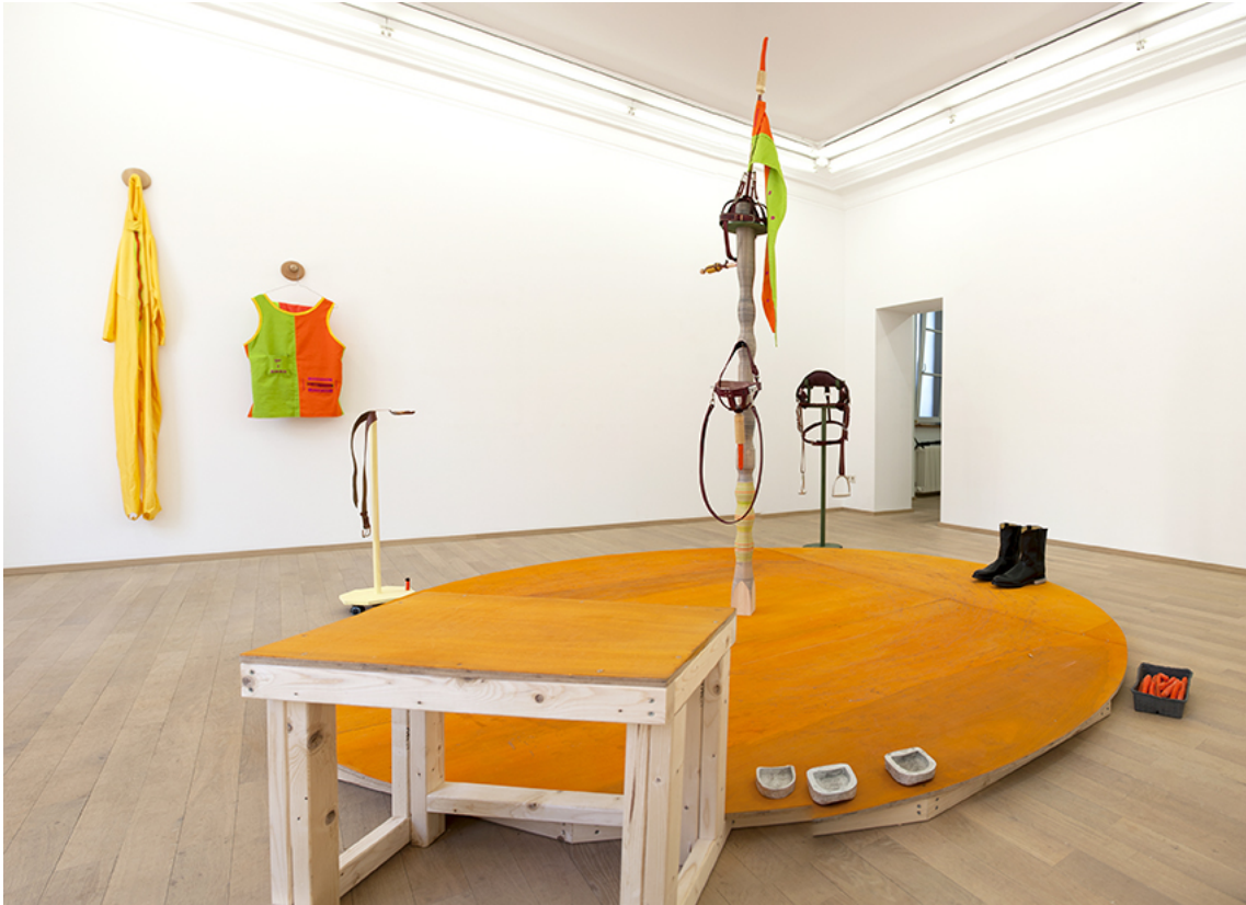
no lemon, no melon , 2018 Mixed media Dimensions variable