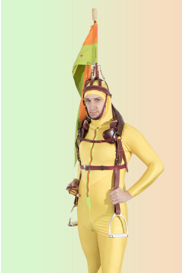
No Lemon, No Melon Exhibition View Nosbaum Reding, Luxembourg, 2018