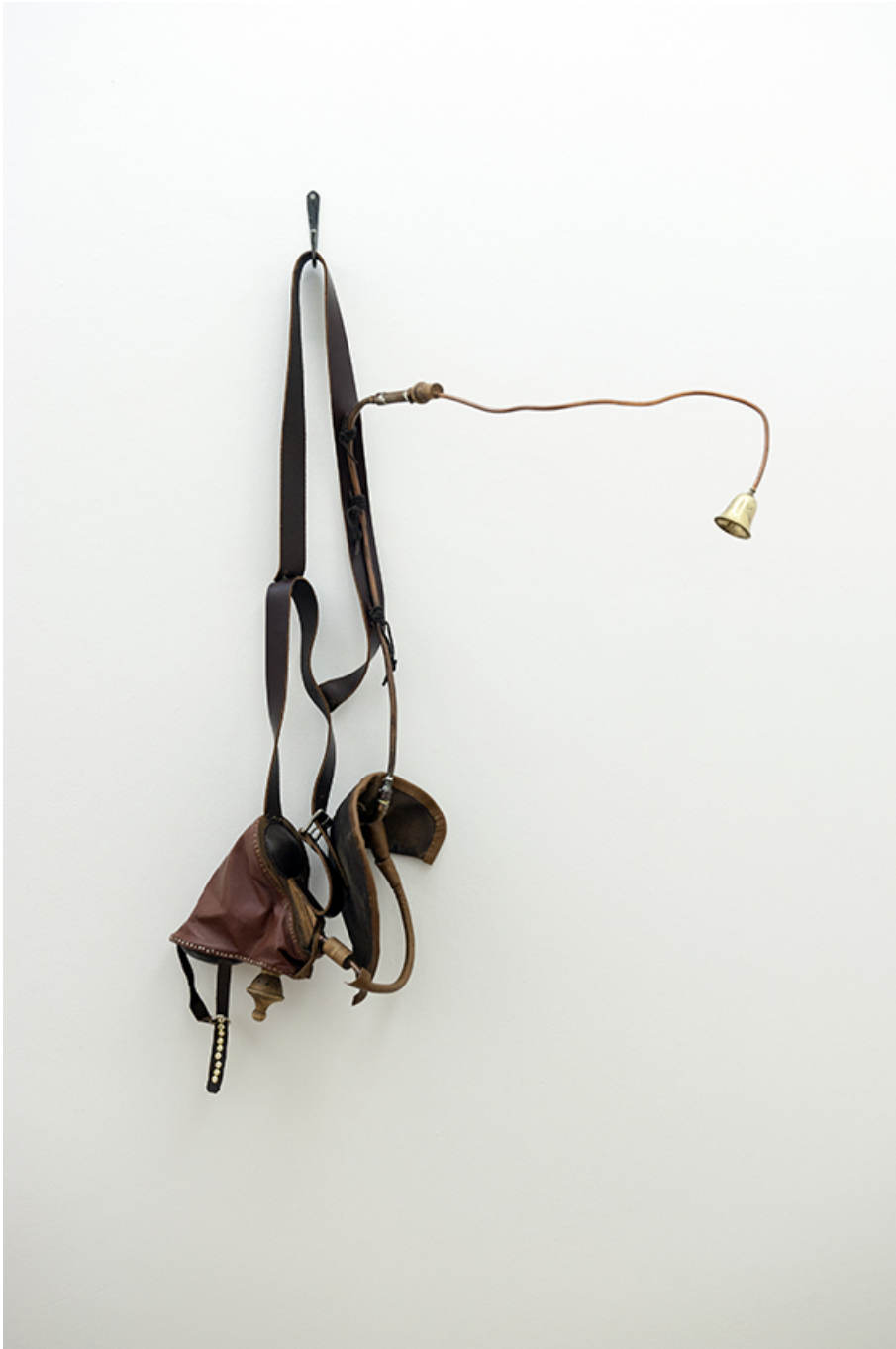
Introducing myself to the Canada geese , 2012 Leather, wood, copper, reed 123 x 83 x 38,5 cm