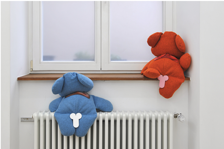
Placid & Llimpid : 3am Miracle, a Fragment Exhibition View Nosbaum Reding, Luxembourg, 2018