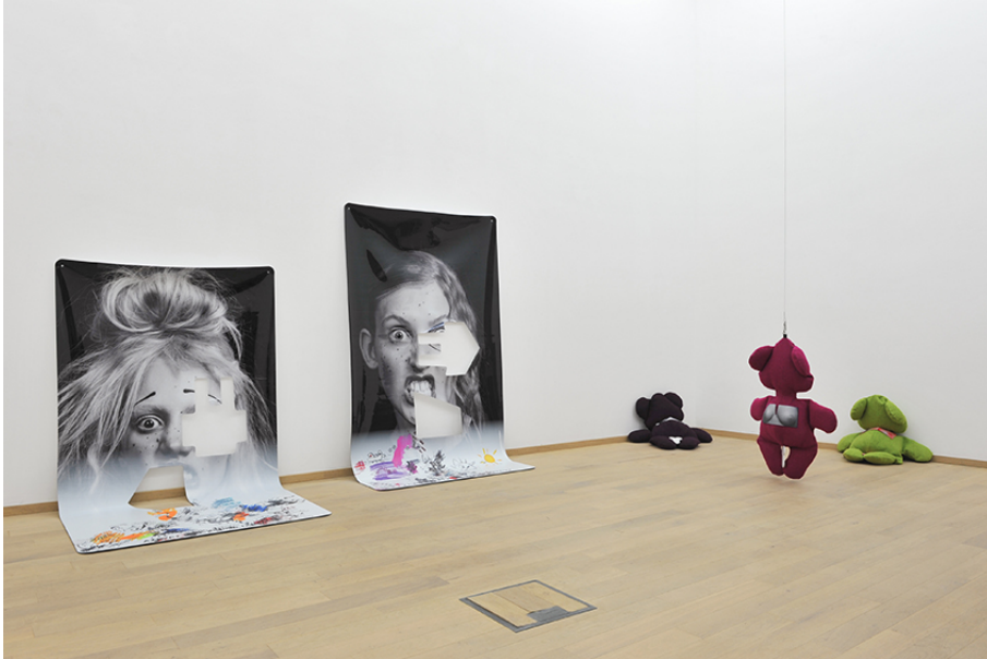
Placid & Llimpid : 3am Miracle, a Fragment Exhibition View Nosbaum Reding, Luxembourg, 2018