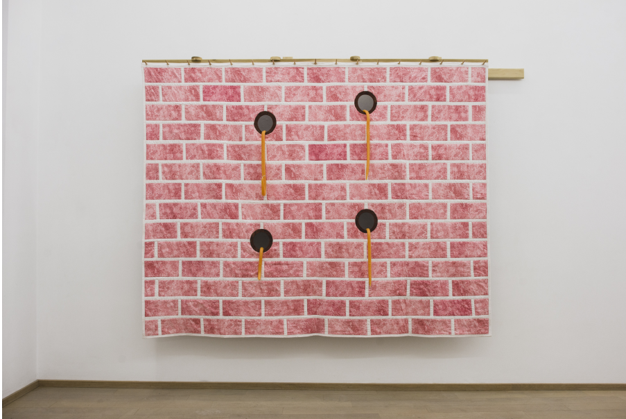
Filled with Fluff and Emotions Exhibition View Nosbaum Reding, Luxembourg, 2020