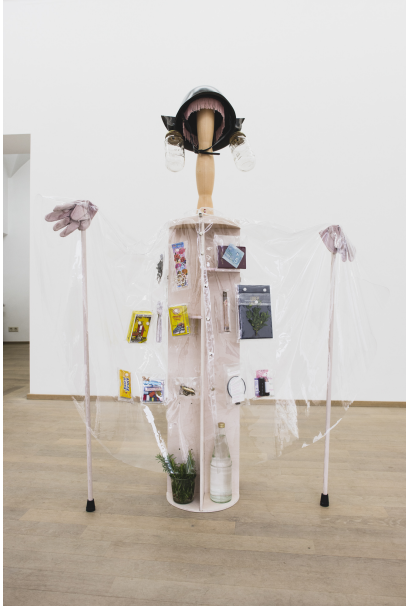
Filled with Fluff and Emotions Exhibition View Nosbaum Reding, Luxembourg, 2020