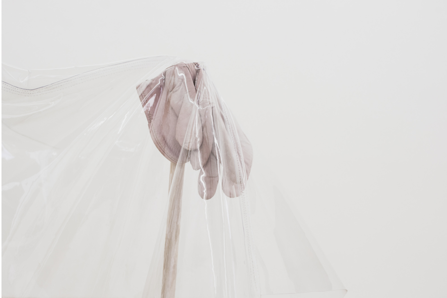
Filled with Fluff and Emotions Exhibition View Nosbaum Reding, Luxembourg, 2020