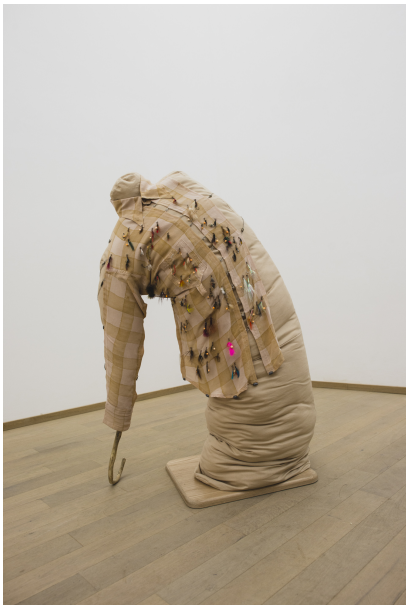
Filled with Fluff and Emotions Exhibition View Nosbaum Reding, Luxembourg, 2020