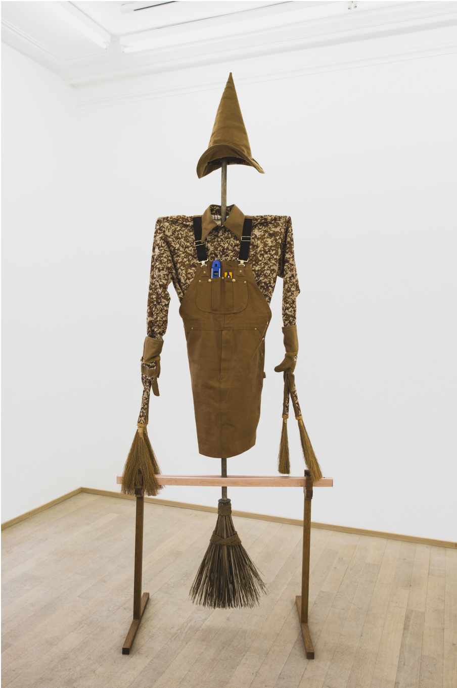
The wicked scarecrow , 2020

Camouflage Fabric, duck canvas, handmade gloves with 2 handmade brooms, Carhartt pants made into a skirt, found broom, wood stand (oak, pine) 90.55 x 23.62 x 19.69 in ( 230 x 60 x 50 cm )