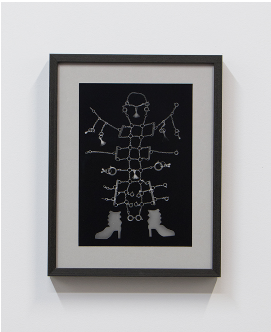
Houdini's wardrobe , 2018 Photogram, framed 11.81 x 8.66 in ( 30,5 x 22,5 cm ) Edition of 5 ex + 2 EA