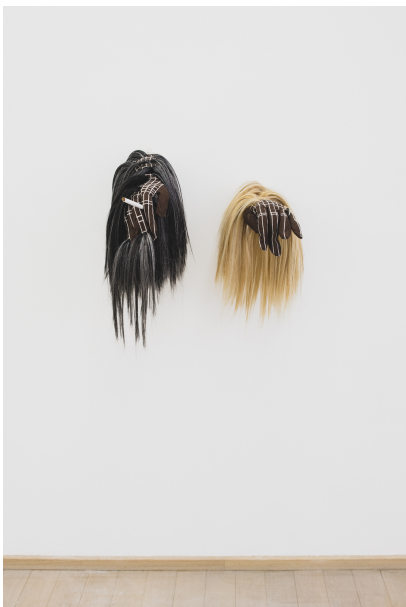
Filled with Fluff and Emotions Exhibition View Nosbaum Reding, Luxembourg, 2020