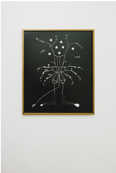
Filled with Fluff and Emotions Exhibition View Nosbaum Reding, Luxembourg, 2020