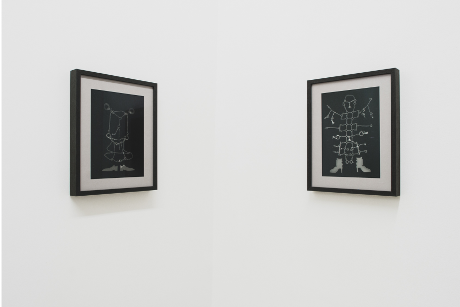
Filled with Fluff and Emotions Exhibition View Nosbaum Reding, Luxembourg, 2020