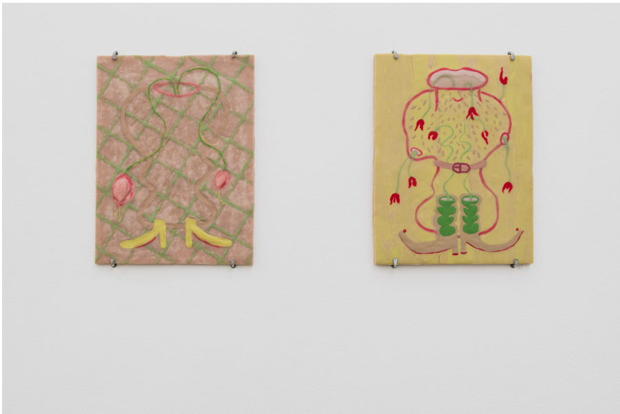
Filled with Fluff and Emotions Exhibition View Nosbaum Reding, Luxembourg, 2020