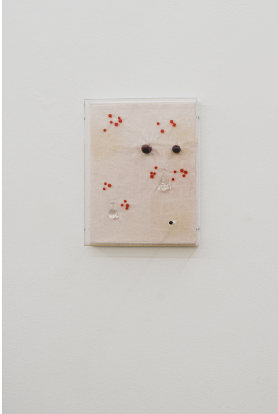
Filled with Fluff and Emotions Exhibition View Nosbaum Reding, Luxembourg, 2020