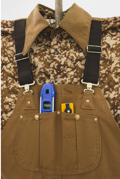
Filled with Fluff and Emotions Exhibition View Nosbaum Reding, Luxembourg, 2020