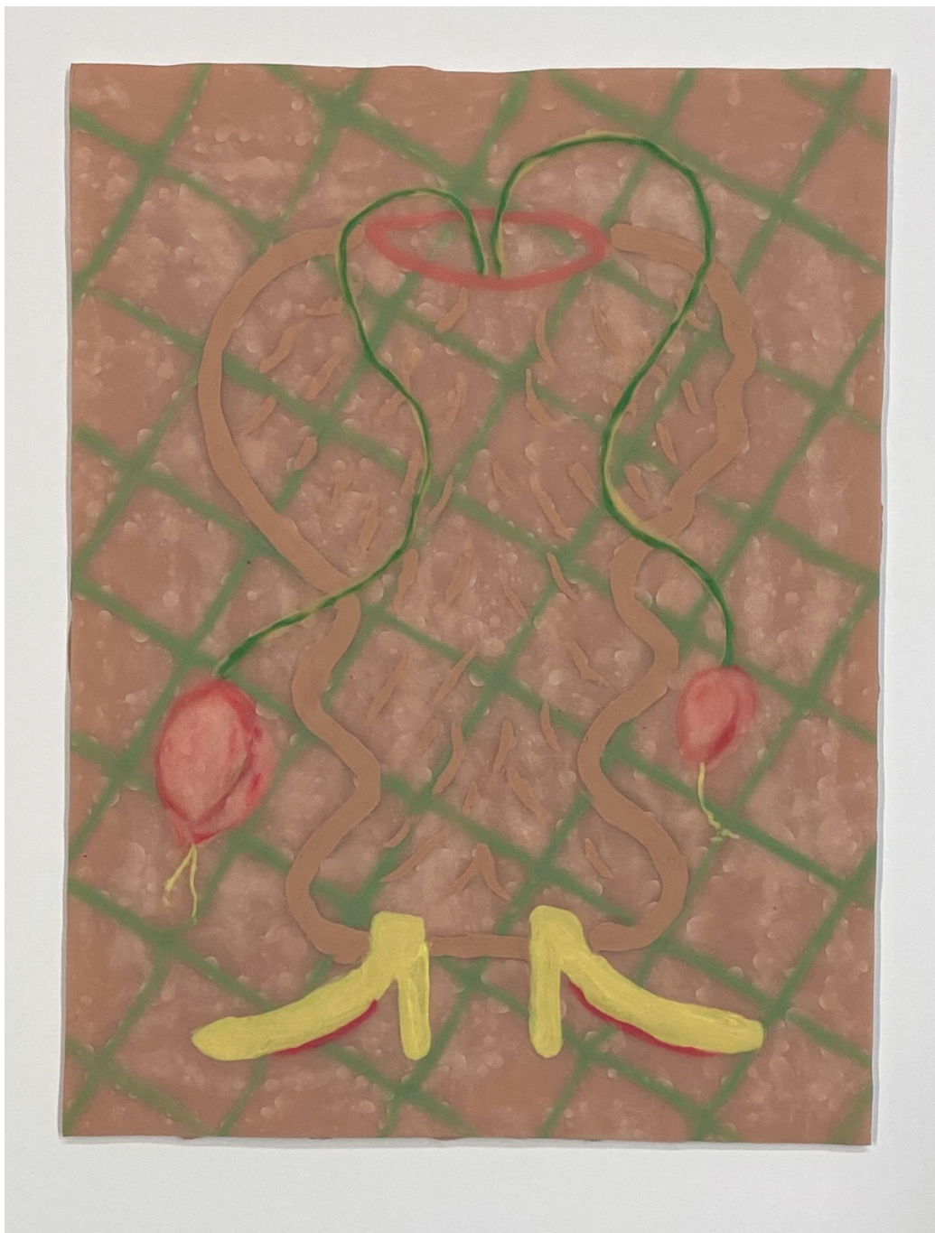
Categorical Imperative 2 , 2020 Polymer clay, Pâte polymère 10.24 x 7.48 in ( 26 x 19,5 x 0,5 cm )