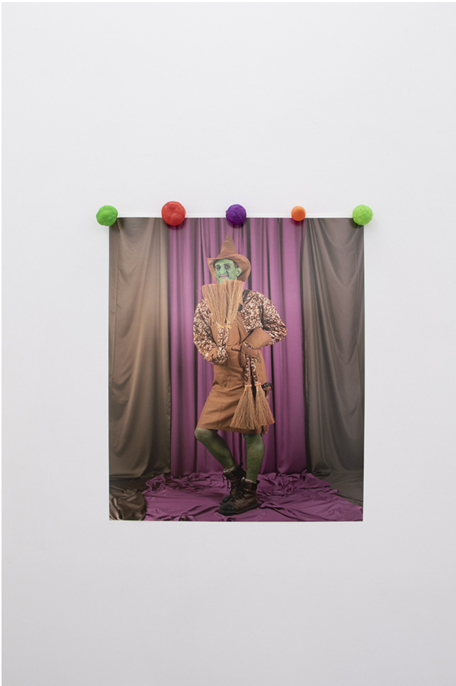
A farmer's apprentice: A day in the field , 2020 Inkjet print, plastic vegetable magnets Image : 29.92 x 24.41 in ( 76 x 62 cm )