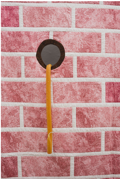
Filled with Fluff and Emotions Exhibition View Nosbaum Reding, Luxembourg, 2020