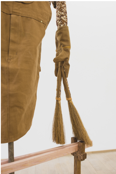
Filled with Fluff and Emotions Exhibition View Nosbaum Reding, Luxembourg, 2020