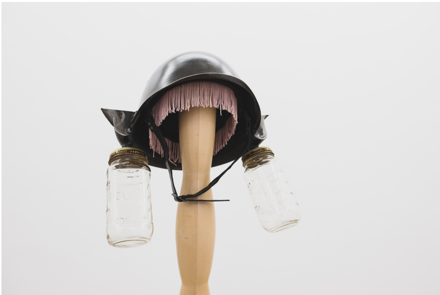
Filled with Fluff and Emotions Exhibition View Nosbaum Reding, Luxembourg, 2020