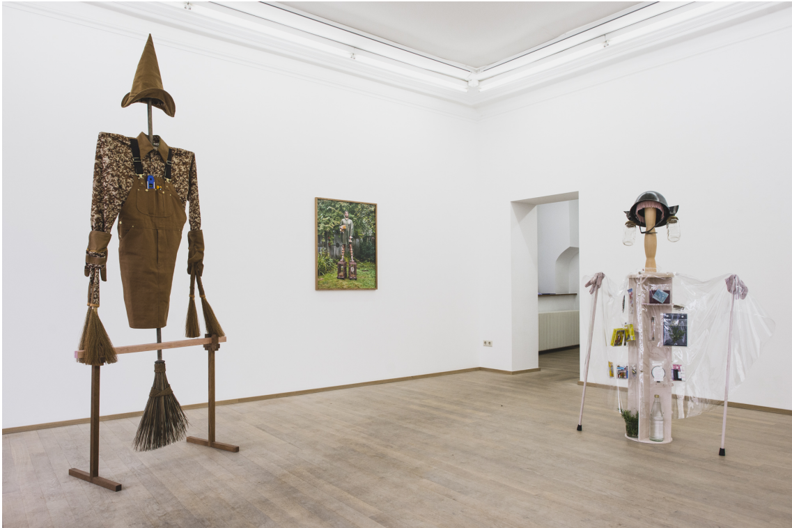
Filled with Fluff and Emotions Exhibition View Nosbaum Reding, Luxembourg, 2020