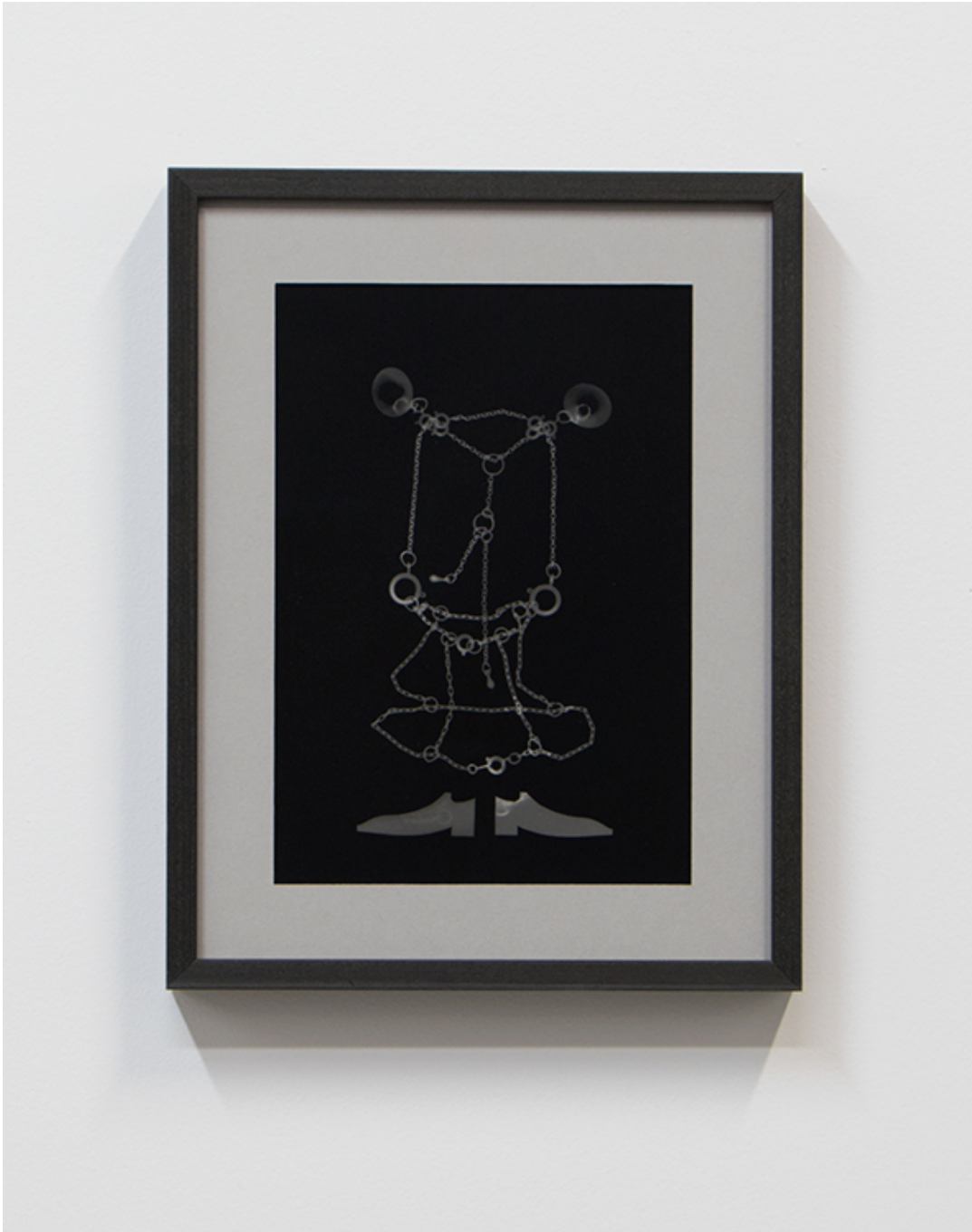
Houdini's wardrobe , 2018 photogram, framed 11.81 x 8.66 in ( 30,5 x 22,5 cm ) Edition of 5 ex + 2 EA