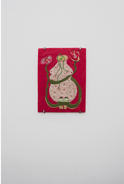
Filled with Fluff and Emotions Exhibition View Nosbaum Reding, Luxembourg, 2020