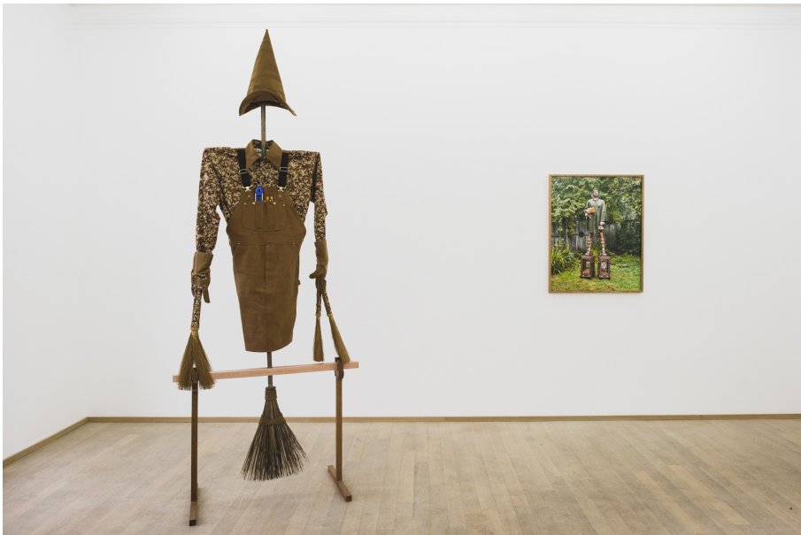
Filled with Fluff and Emotions Exhibition View Nosbaum Reding, Luxembourg, 2020