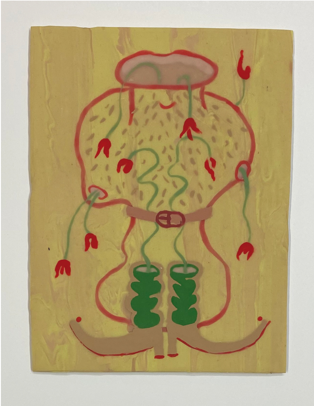
Categorical Imperative 1 , 2020 Polymer clay 10.24 x 7.48 in ( 26 x 19,5 x 0,5 cm )