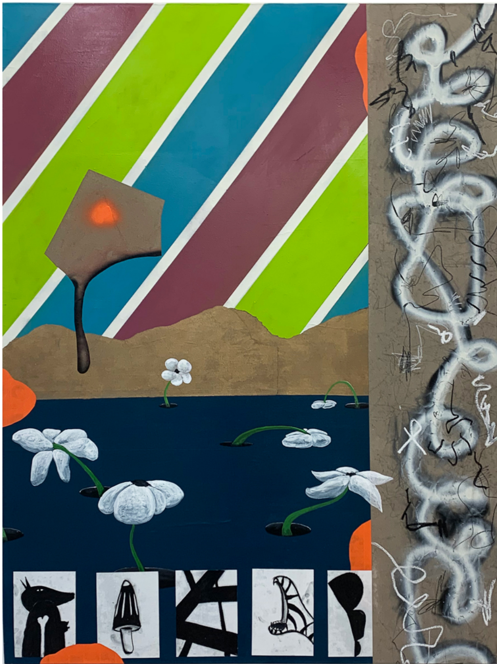
Dream yourself to oblivion , 2020 Mixed media and collage on canvas 62.99 x 47.24 in ( 160 x 120 cm )