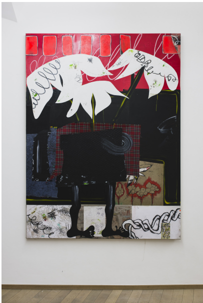
More Strippers Please, ...! Exhibition View Nosbaum Reding, Luxembourg, 2021