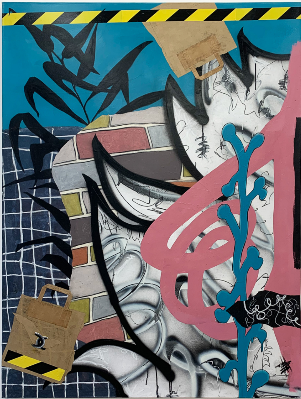
Chanel can solve it all, 2020 Mixed media and collage on canvas 62.99 x 47.24 in ( 160 x 120 cm )