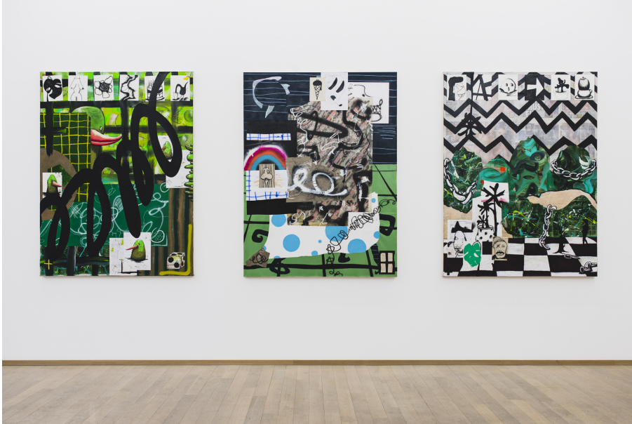
More Strippers Please, ...! Exhibition View Nosbaum Reding, Luxembourg, 2021