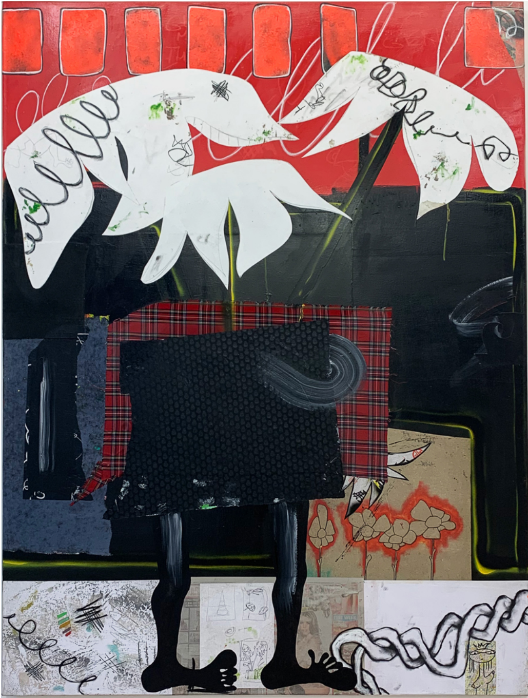
Have a nice day Mr President, 2020 Mixed media and collage on canvas 78.74 x 59.06 in ( 200 x 150 cm )