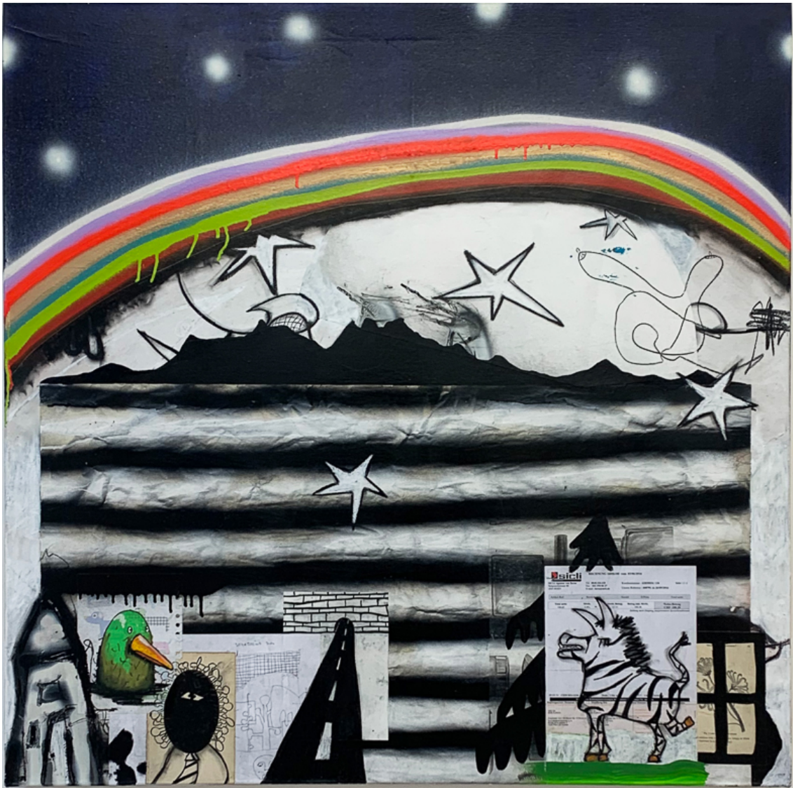
Jetzt erst recht , 2020 Mixed media and collage on canvas 43.31 x 43.31 in ( 110 x 110 cm )