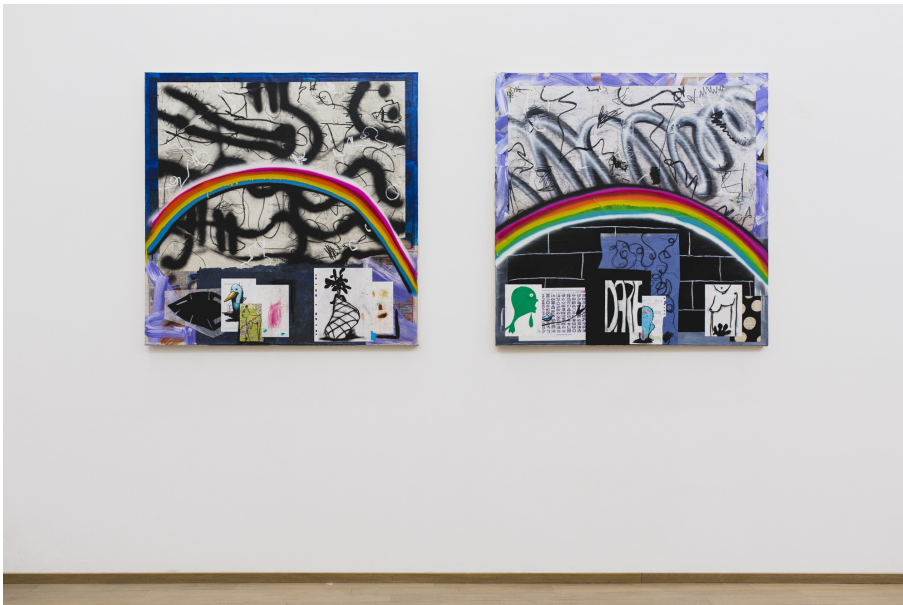
More Strippers Please, ...! Exhibition View Nosbaum Reding, Luxembourg, 2021