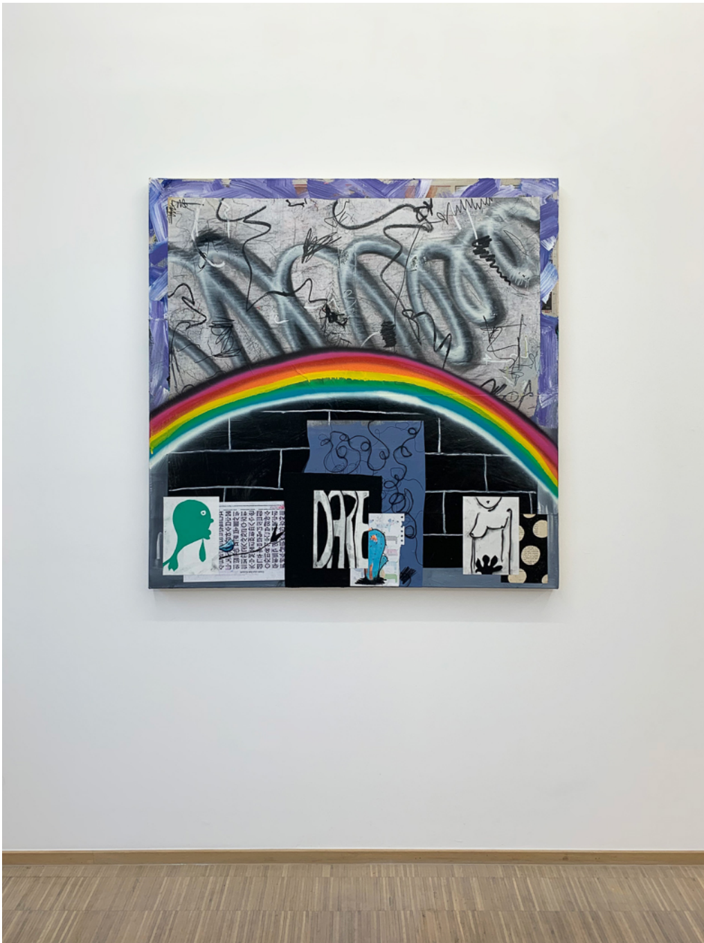
Wild dreams die hard , 2020 Mixed media and collage on canvas 43.31 x 43.31 in ( 110 x 110 cm )