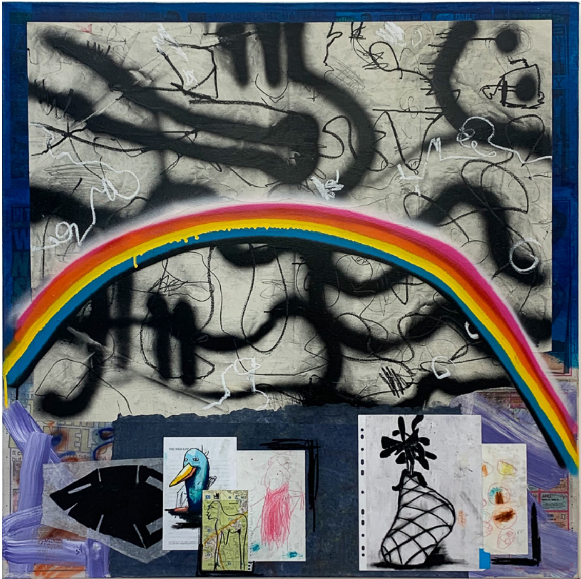
Seven weeks without rain, 2020 Mixed media and collage on canvas 43.31 x 43.31 in ( 110 x 110 cm )