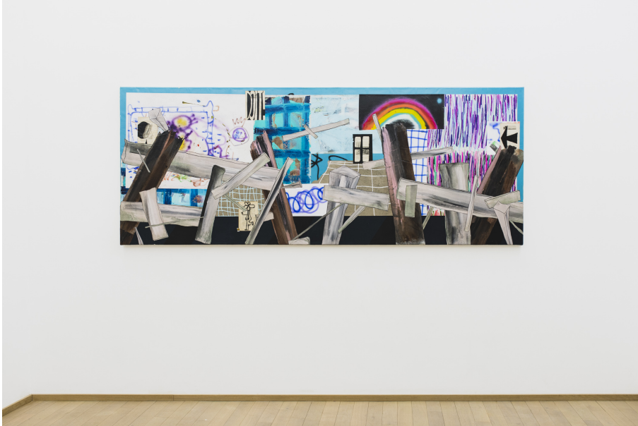
More Strippers Please, ...! Exhibition View Nosbaum Reding, Luxembourg, 2021