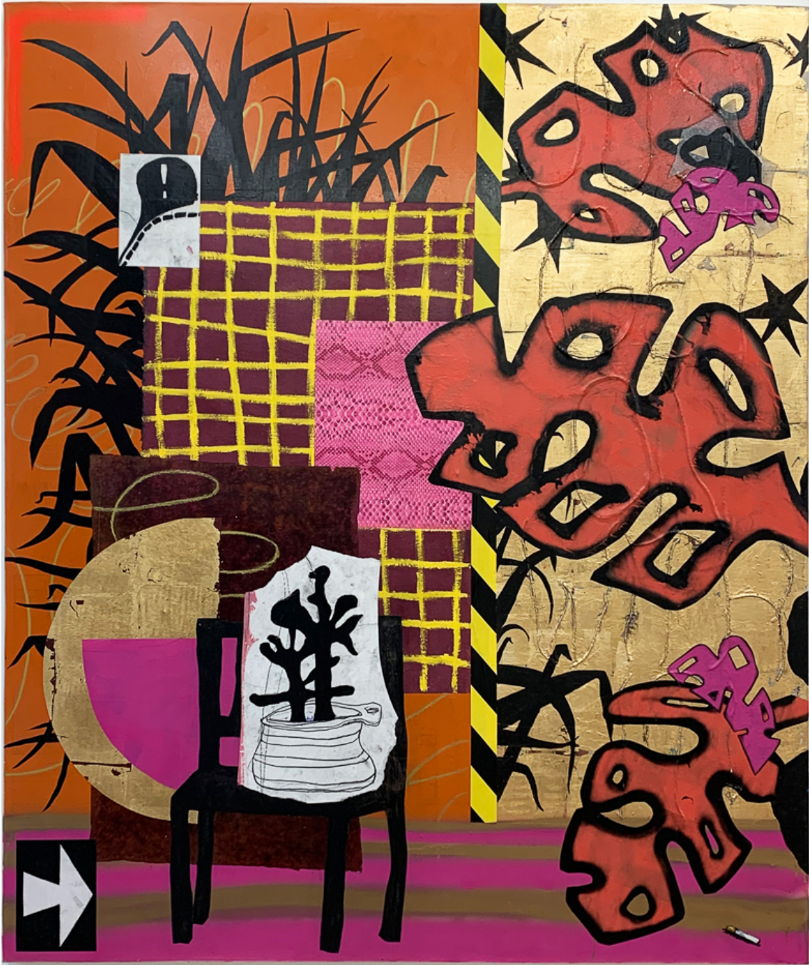
The rebirth of dignity is imminent, 2020 Mixed media and collage on canvas 70.87 x 59.06 in ( 180 x 150 cm )