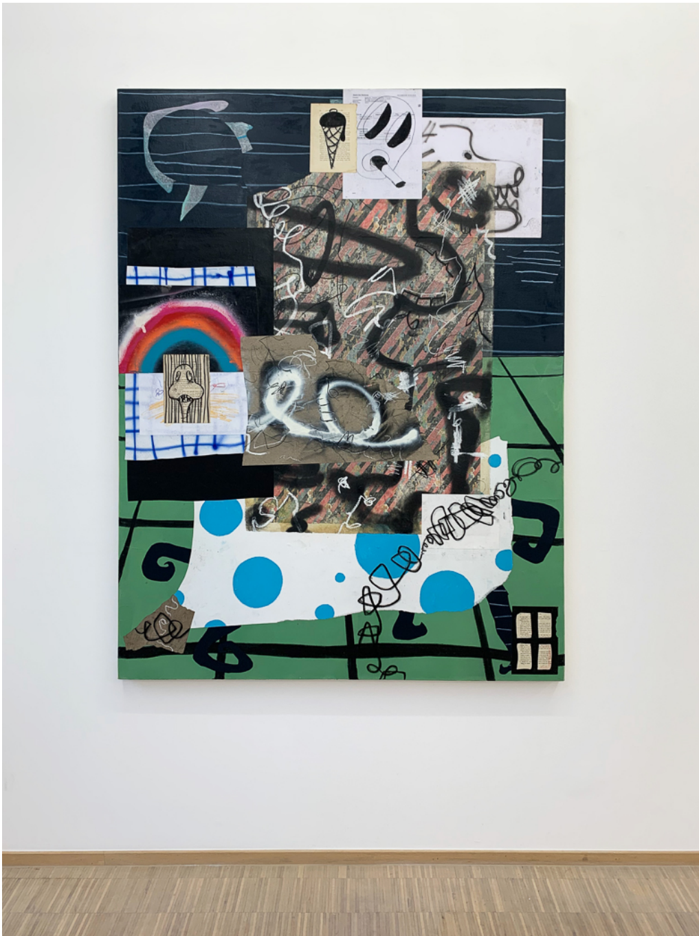
Picasso would have copied it , 2020 Mixed media and collage on canvas 62.99 x 47.24 in ( 160 x 120 cm )