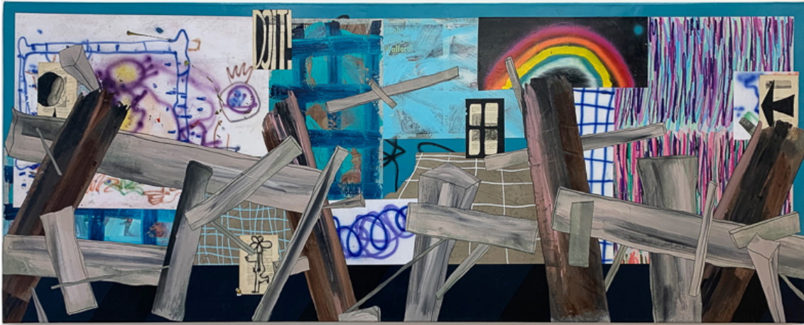
255 cm of pure bliss, 2020 Mixed media and collage on canvas 39.37 x 100.39 in ( 100 x 255 cm )