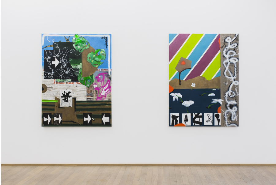
More Strippers Please, ...! Exhibition View Nosbaum Reding, Luxembourg, 2021