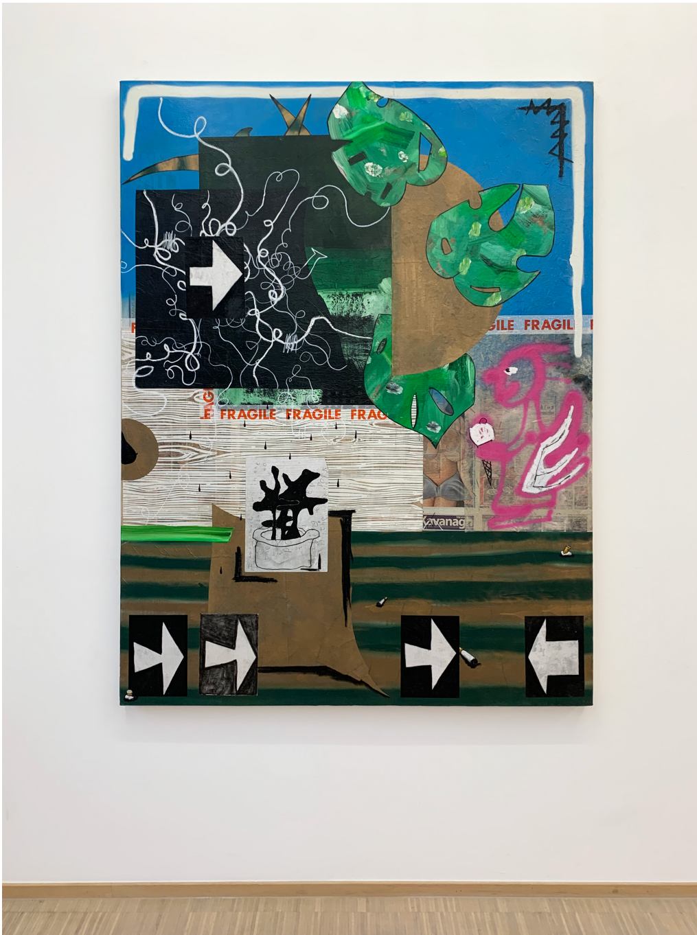
Why run when there is no reason,...? , 2020 Mixed media and collage on canvas 62.99 x 47.24 in ( 160 x 120 cm )