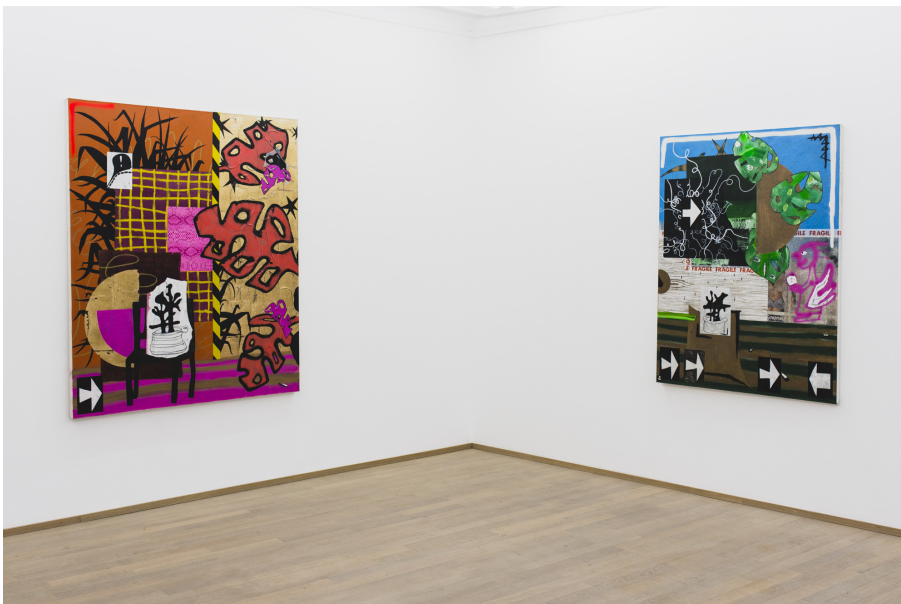
More Strippers Please, ...! Exhibition View Nosbaum Reding, Luxembourg, 2021