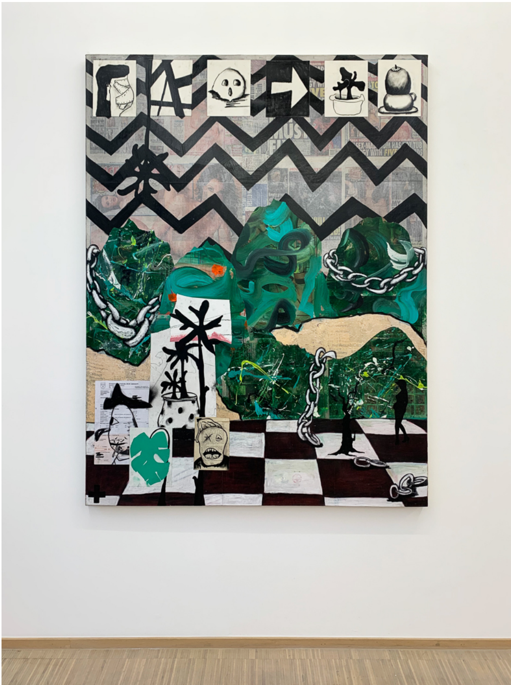
Just made myself a sandwich , 2020 Mixed media and collage on canvas 62.99 x 47.24 in ( 160 x 120 cm )