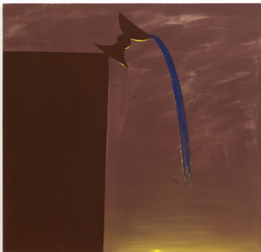
Moataz Alqaissy, Priscilla Gils, Anouk Van Offenwert, Witold Vandenbroeck Exhibition View Nosbaum Reding, Luxembourg, 2024