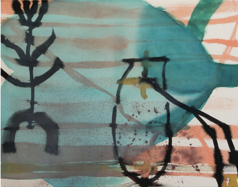
Moataz Alqaissy, Priscilla Gils, Anouk Van Offenwert, Witold Vandebroek Exhibition View Nosbaum Reding, Luxembourg, 2024