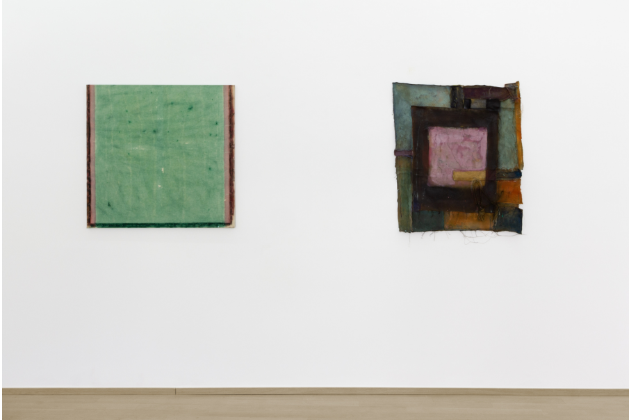
Moataz Alqaissy, Priscilla Gils, Anouk Van Offenwert, Witold Vandebroeck Exhibition View Nosbaum Reding, Luxembourg, 2024