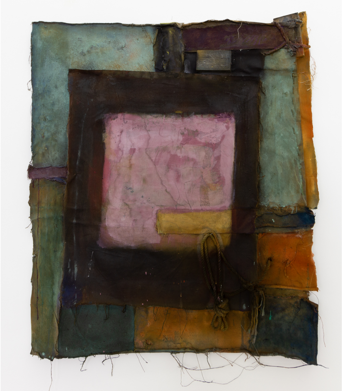
Untitled , 2024 mixed technique on canvas 36.61 x 27.56 in ( 93,5 x 70,2 cm )

Moataz Alqaissy, Priscilla Gils, Anouk Van Offenwert, Witold Vandenbroeck