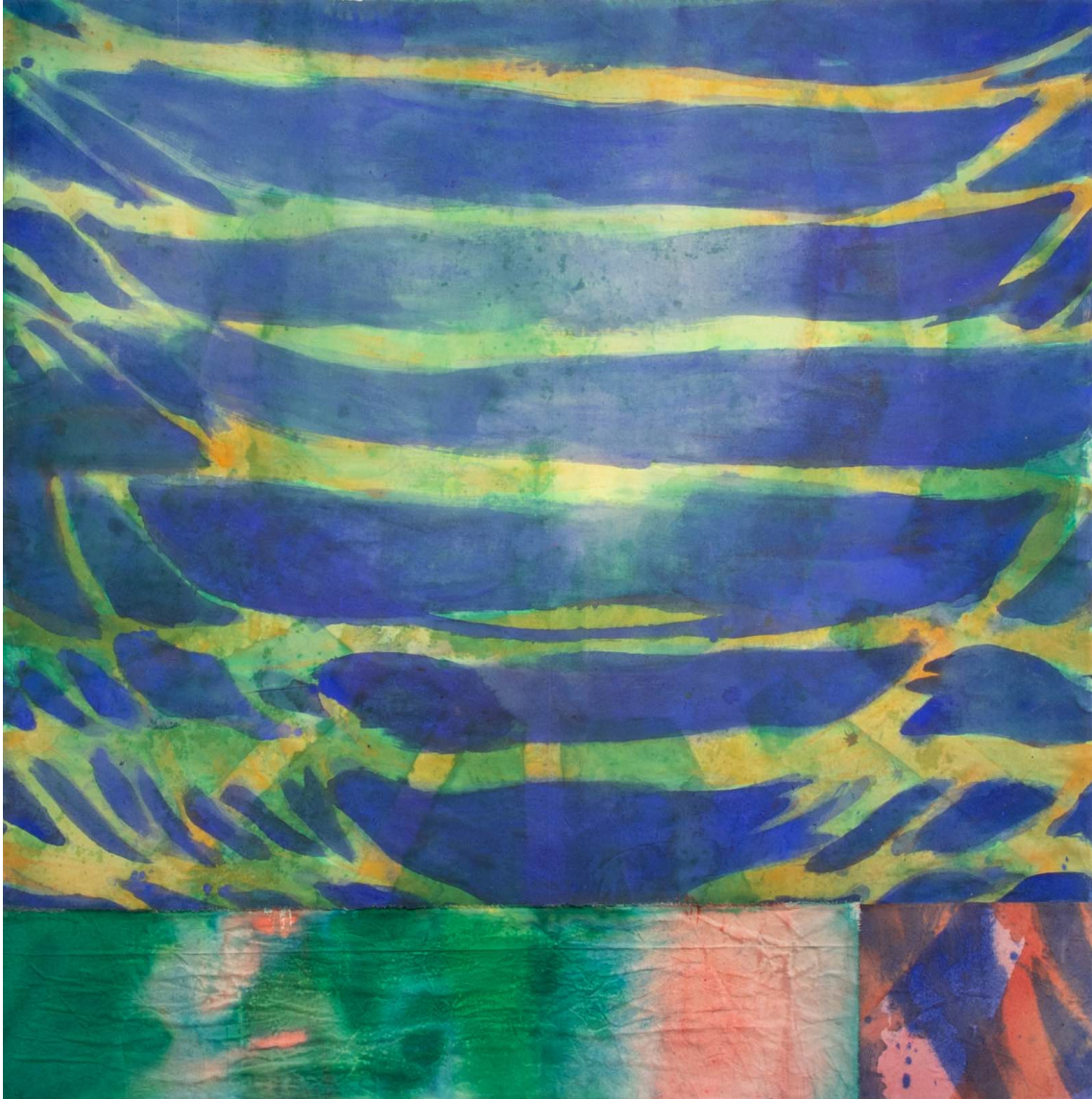
Mirage , 2024 Casein on cotton 55.12 x 55.12 in ( 140 x 140 cm )

Moataz Alqaissy, Priscilla Gils, Anouk Van Offenwert, Witold Vandenbroeck