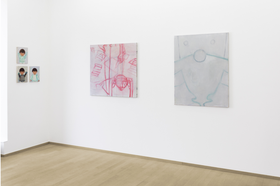
Moataz Alqaissy, Priscilla Gils, Anouk Van Offenwert, Witold Vandebroeck Exhibition View Nosbaum Reding, Luxembourg, 2024