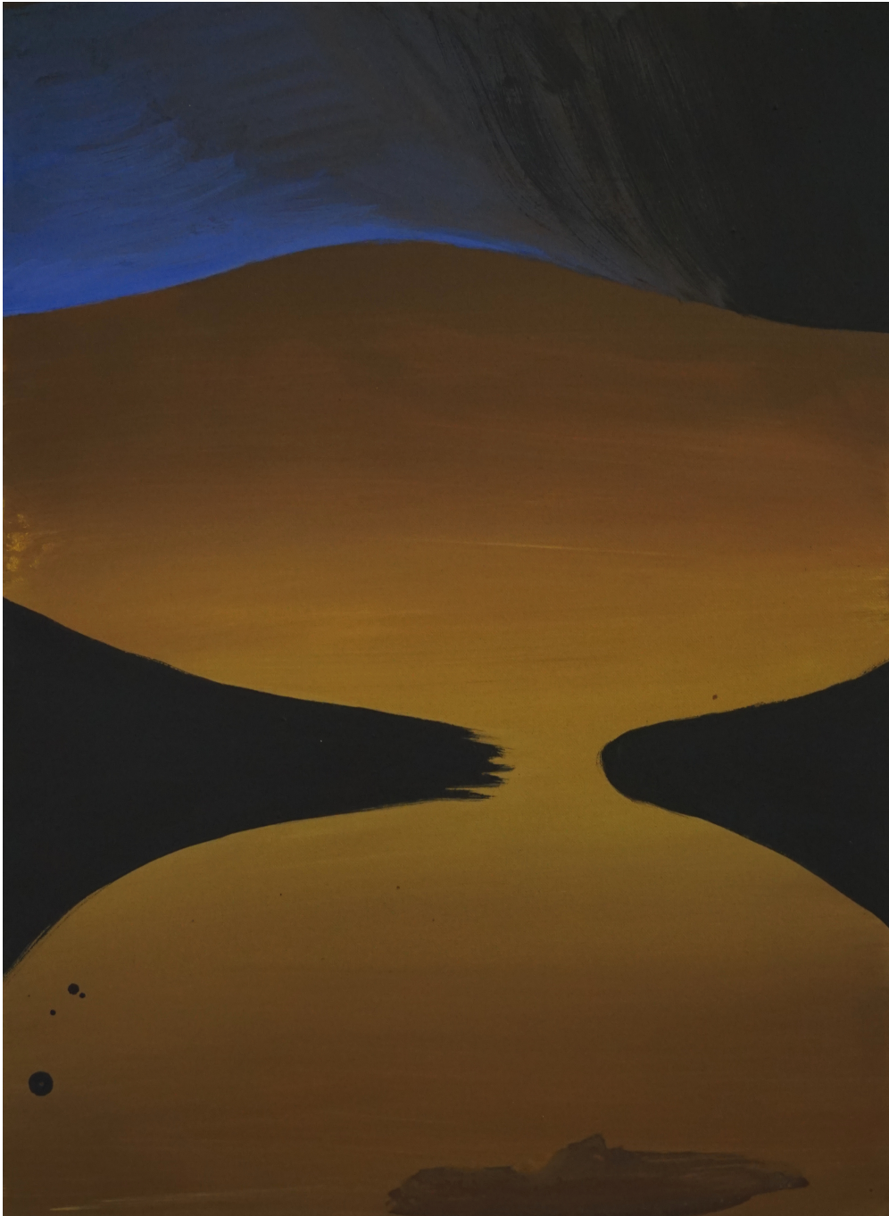
Untitled, 2023 Distemper on Canvas 26.38 x 19.29 in ( 67 x 49 cm )