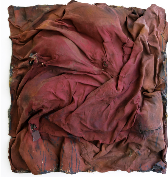
Moataz Alqaissey, Priscilla Gils, Anouk Van Offenwert, Witold Vandebroeck Exhibition View Nosbaum Reding, Luxembourg, 2024