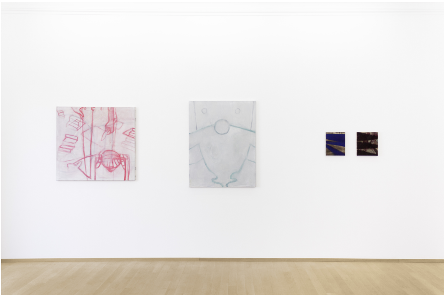
Moataz Alqaissy, Priscilla Gils, Anouk Van Offenwert, Witold Vandebroeck Exhibition View Nosbaum Reding, Luxembourg, 2024