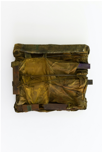
Moataz Alqaissy, Priscilla Gils, Anouk Van Offenwert, Witold Vandebroeck Exhibition View Nosbaum Reding, Luxembourg, 2024