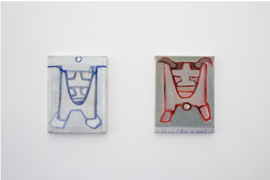
Moataz Alqaissy, Priscilla Gils, Anouk Van Offenwert, Witold Vandebroek Exhibition View Nosbaum Reding, Luxembourg, 2024