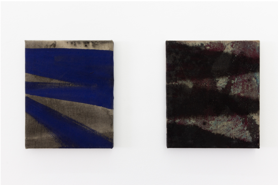
Moataz Alqaissey, Priscilla Gils, Anouk Van Offenwert, Witold Vandebroeck Exhibition View Nosbaum Reding, Luxembourg, 2024