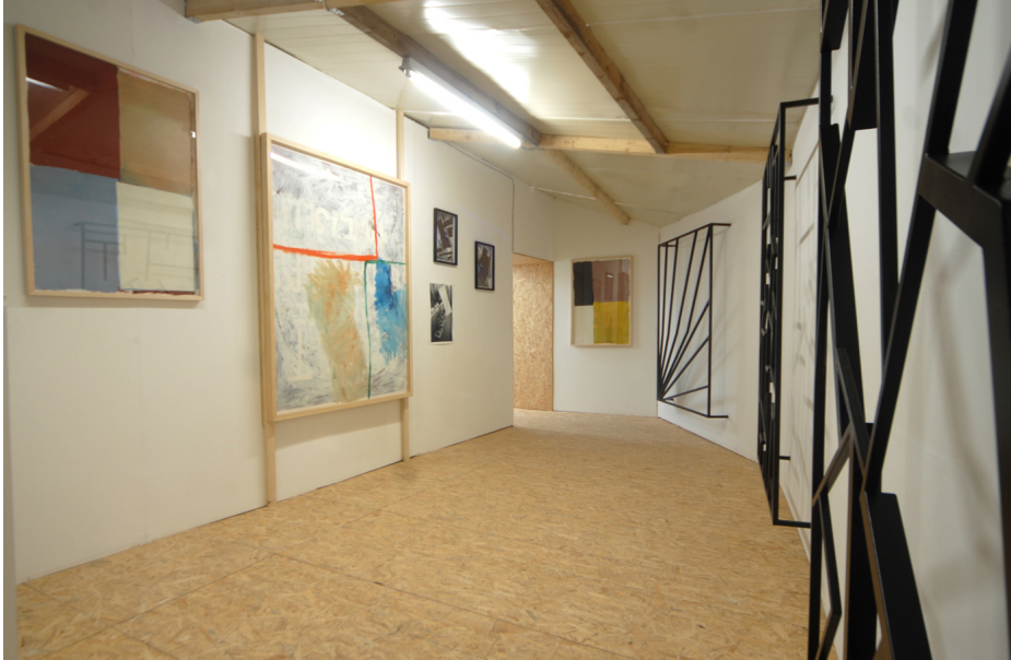
Labyrinth Exhibition View Nosbaum Reding, Luxembourg, 2007