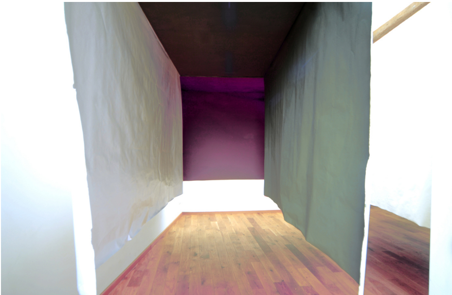
Labyrinth Exhibition View Nosbaum Reding, Luxembourg, 2007